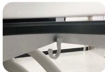
The trolley comes with hooks for hanging disposal bags and others.