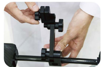
Applicator Clamping Device can be used with different afterloaders: It can be fixed in any direction and patient remains at same position during transfer and treatment.