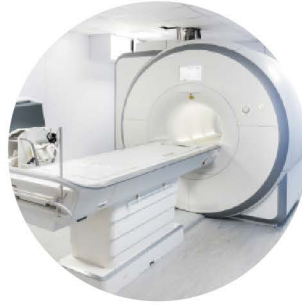
1.5T and 3.0T MRI