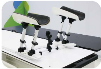
Adjustable Leg Supports and Easy-to-Lock Applicator Clamping Device.