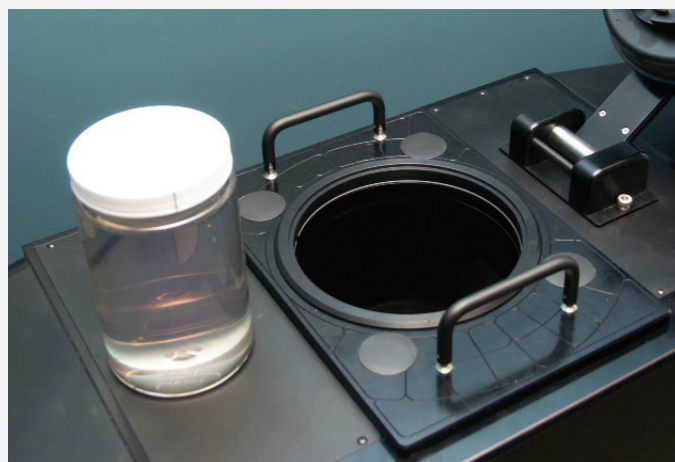
Above: Close-up of the liquid filled Vista™16 aquarium capable of scanning objects up to 15 cm diameter by 12 cm long.

The Vista™ 16 optical CT scanner is designed to work with radiochromic dosimeters, such as Fricke which have an absorption peak at 590 nm or 633 nm. Different wavelengths are available on request for different dosimeters and applications.