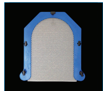
RT-8335 Head Only VersaFrame