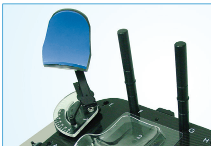
Clocking Plate Arm Support RT-5035-60 Left Support RT-5035-70 Right Support